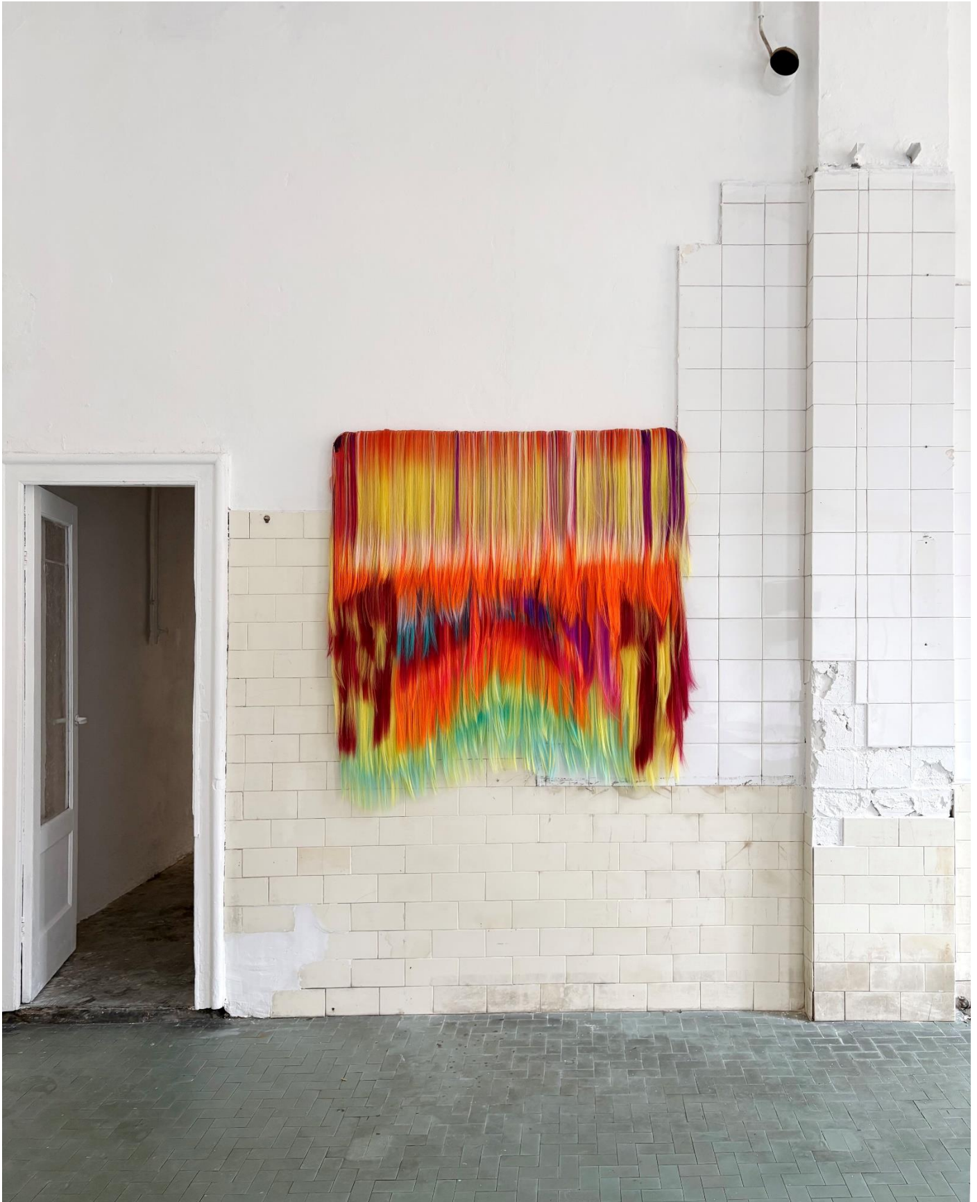
Hiva Alizadeh, Untitled (fluo) installation view at MEGA Art Fair -Room 13