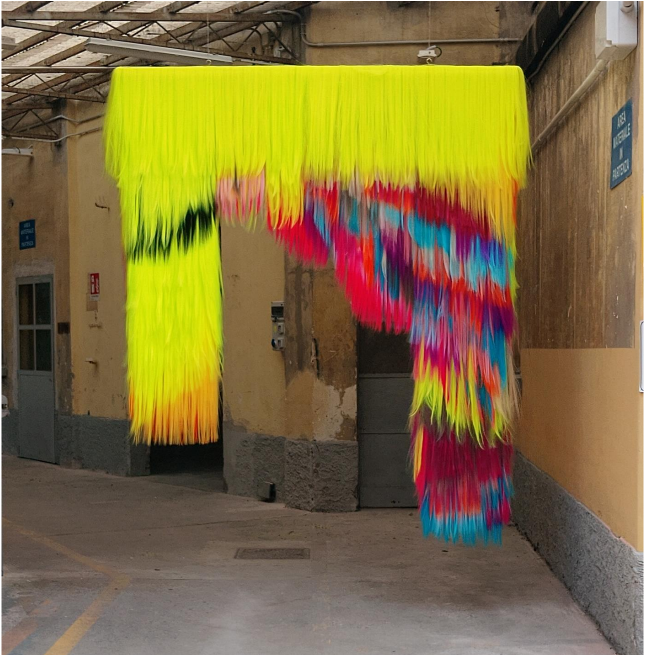
Hiva Alizadeh, Untitled (portal), 2026, Synthetic hair on canvas and wooden bar, 250x205x8 cm. UNIQUE