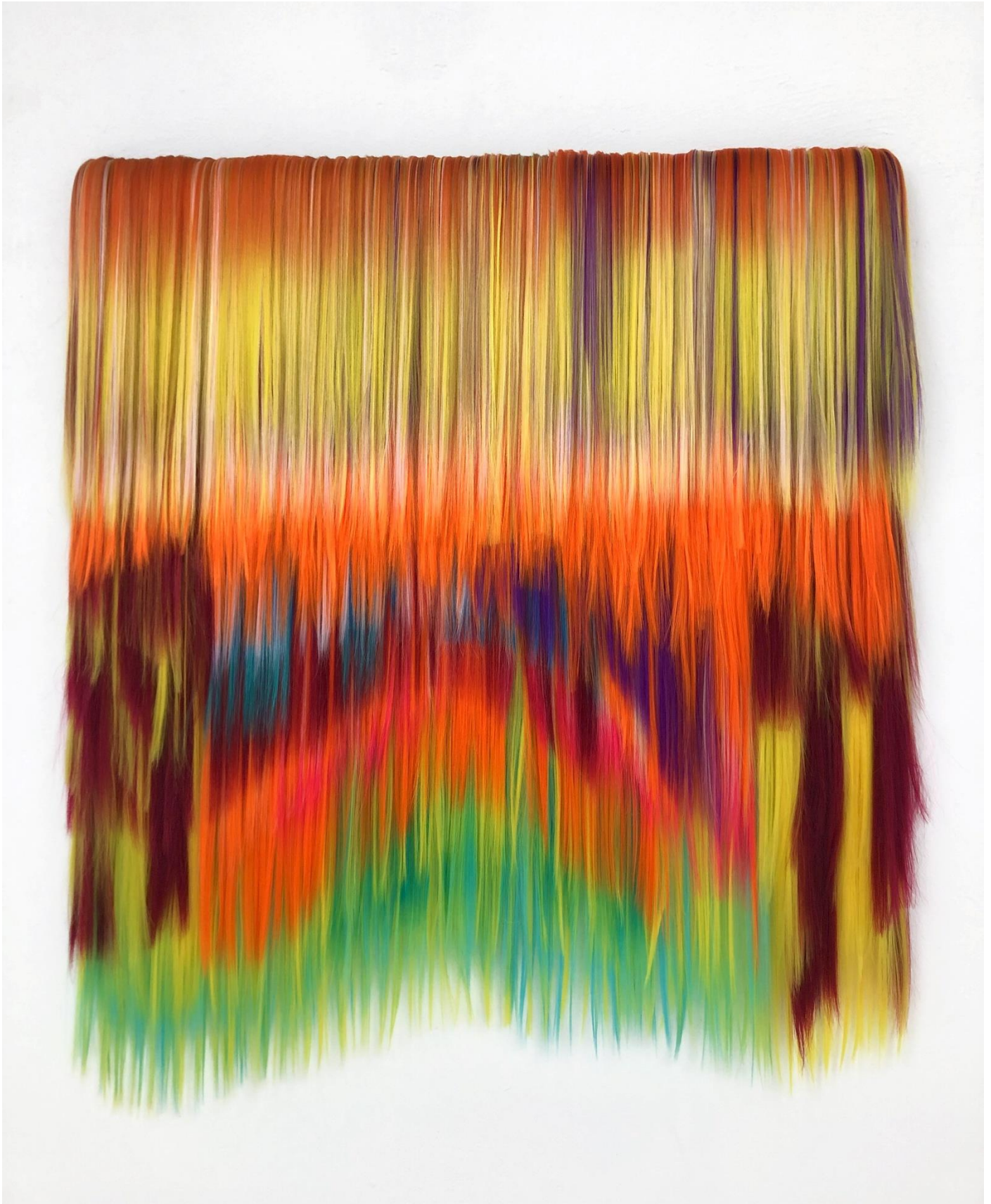
Hiva Alizadeh, Untitled (fluo), 2024, Synthetic hair on canvas and wooden bar, 120x140x8 cm. UNIQUE 11000 €