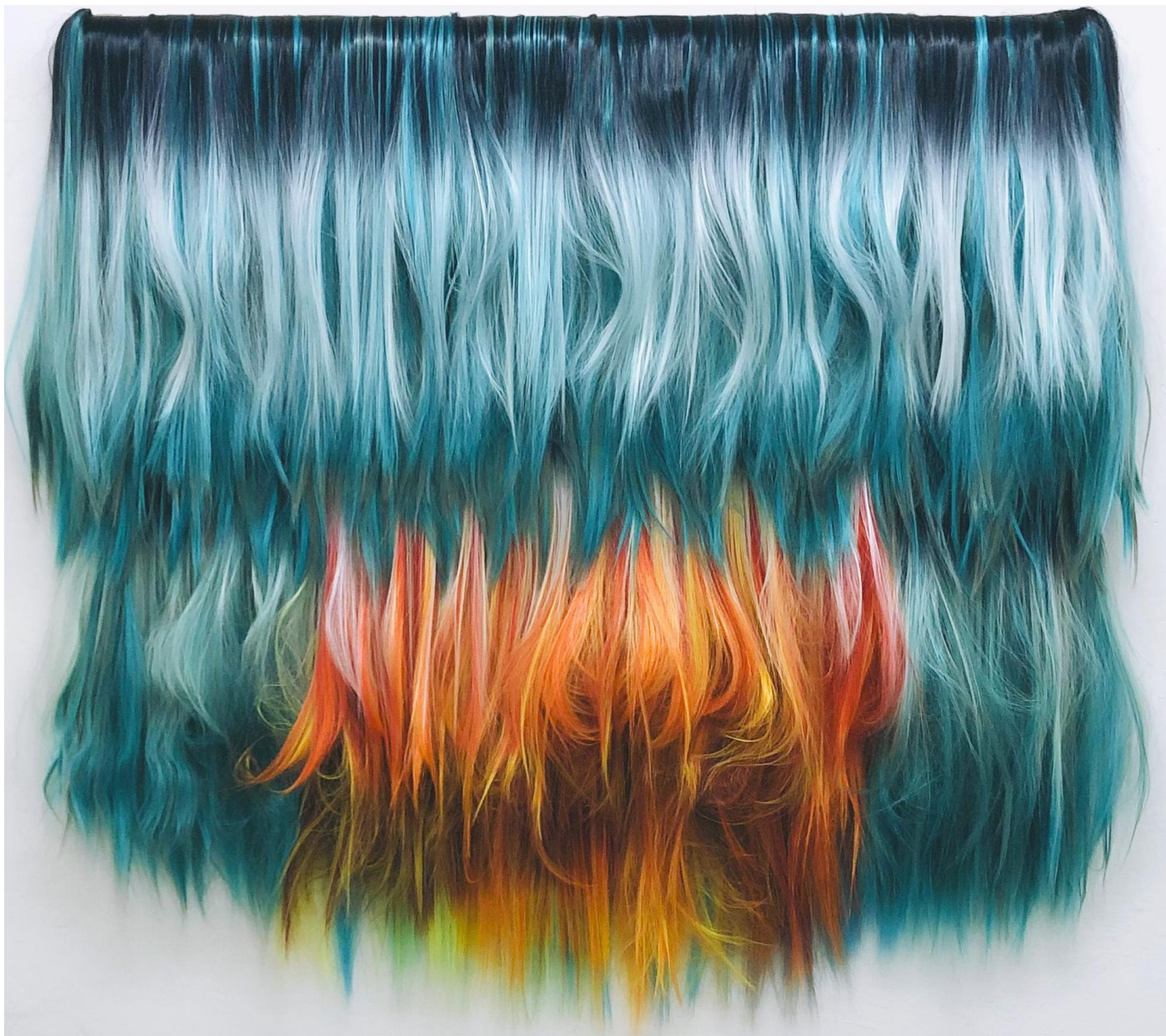
Hiva Alizadeh, Untitled (Waves), 2023 Syntetic hair on canvas and wooden bar, 125x117x8 cm | 49¼x46x3¼ in UNIQUE 10000 €