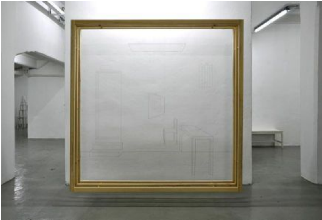
Window – Behind the curtains , 2012, black and red acrylic paint on fishing lines, wood frames, 200x200x25 cm / 79x79x10 inches