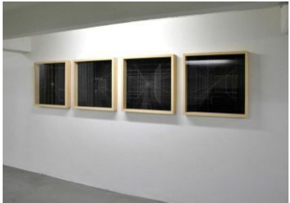
Views of the show

In some works one finds synaesthetic spaces that can be lived or travelled through: spaces in which one's senses are incited, superimposed or amplified. In others, one enters into a sort of limbo that bridges both the finite and infinite realm. Thus space becomes a continual evolution, a Void. From that which can be transformed, suspended, eternally transient, Paolo Cavinato arrives at a representation of the absolute through a kind of infinitesimal mantra.