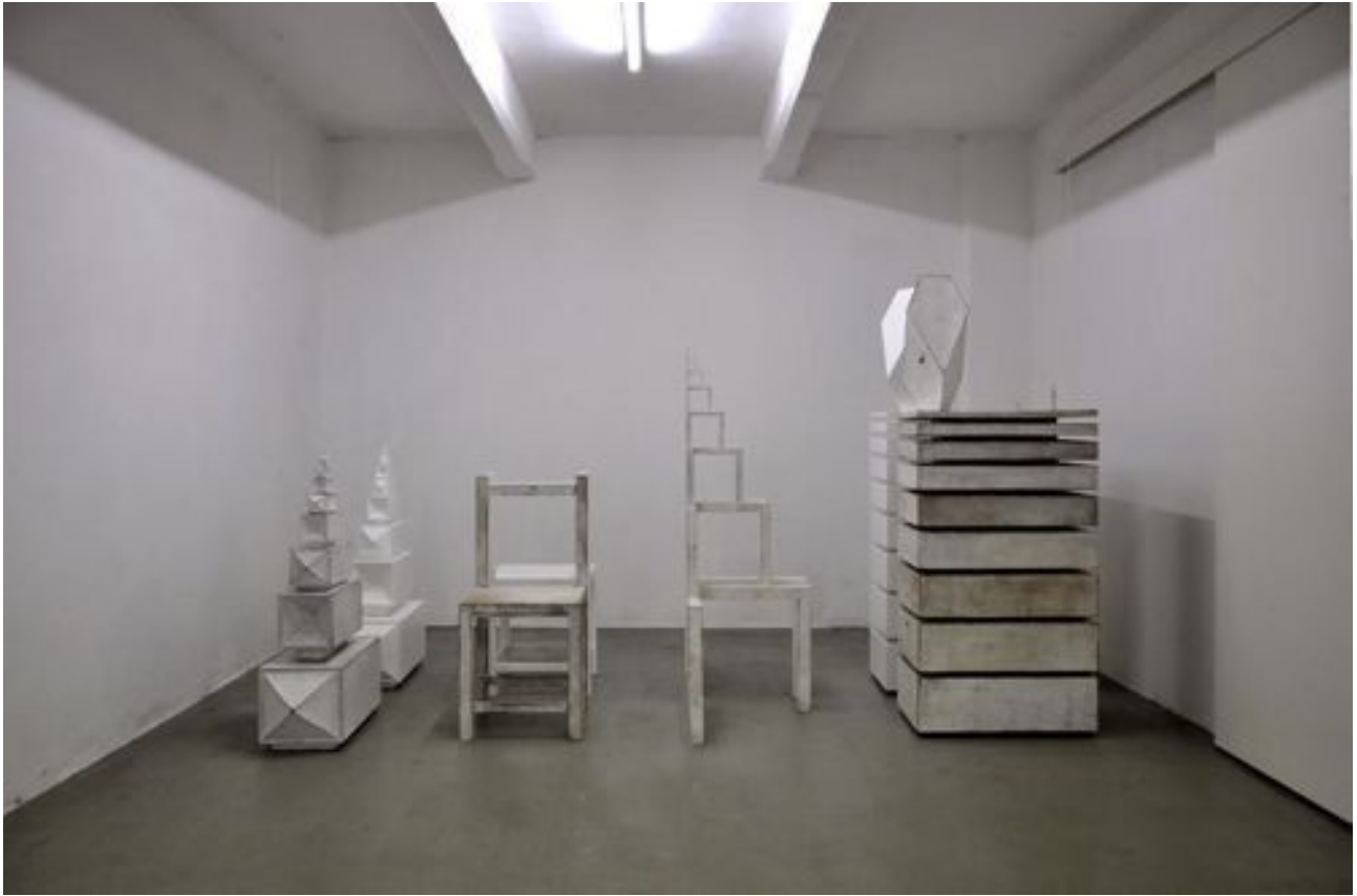
Reflections , 2010, varnished wood, scratched cardboard, variable dimensions.