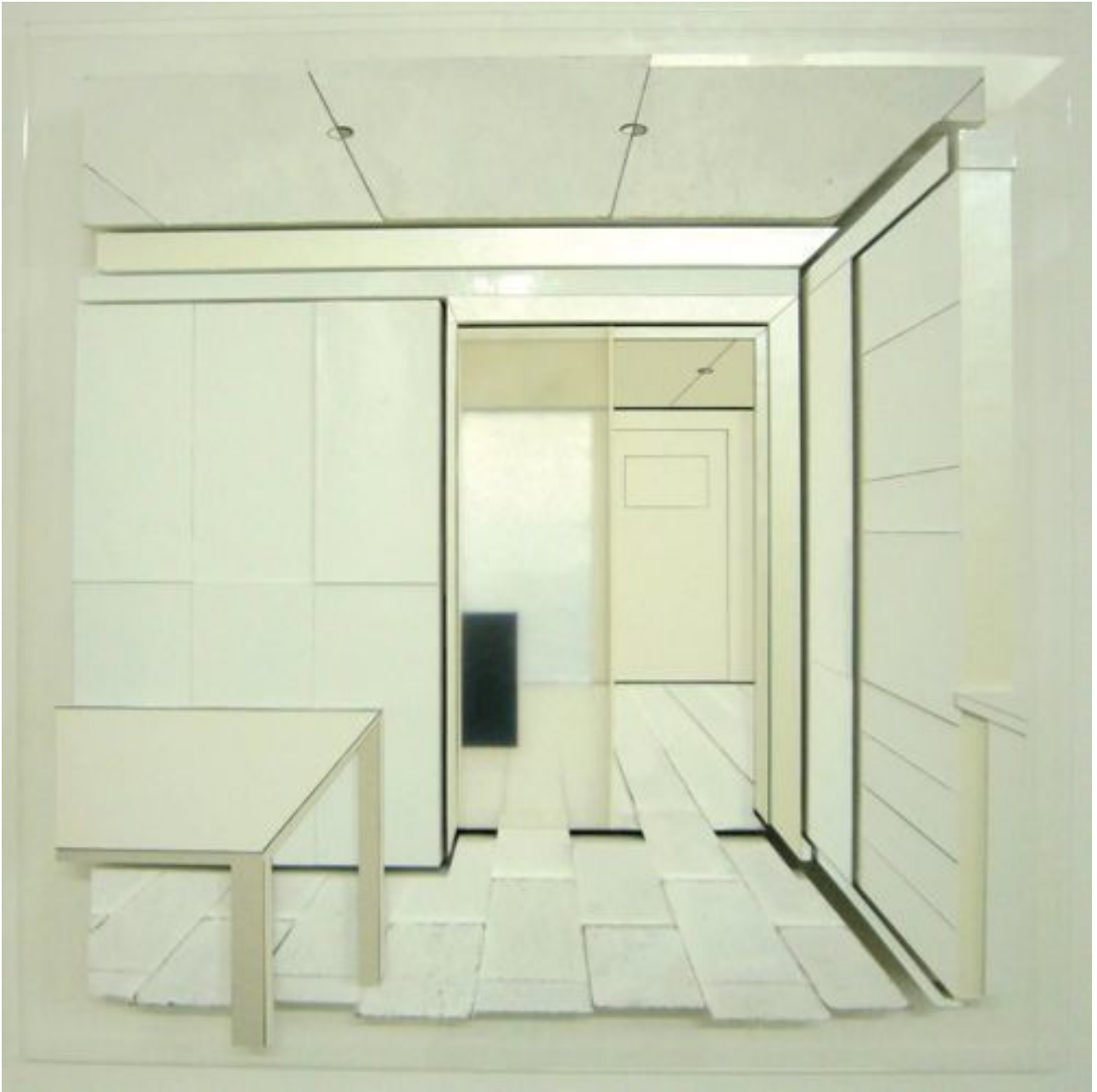
Rilievo, #2 _ cucina con presenza , 2012, white acrylic paint, paper, cardboard, acrylic, plastic sheets, plexiglass, 85x85x8 cm / 34x34x3 inches