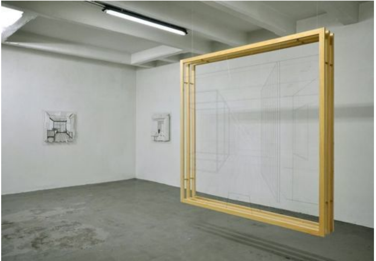
Window – corridor , 2012, black acrylic paint on fishing lines, wood frames, 200x200x25 cm / 79x79x10 inches