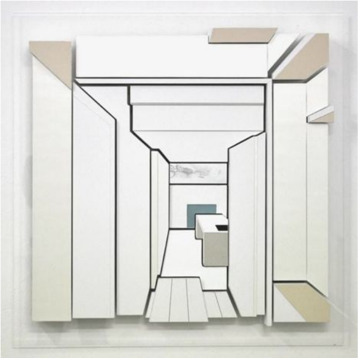
Rilievo#4_ Studiolo con quaderno nero , 2012, paper, cardboard, white acrylic paint, plastic sheets, plexiglass, 85x85x8 cm / 34x34x3 inches