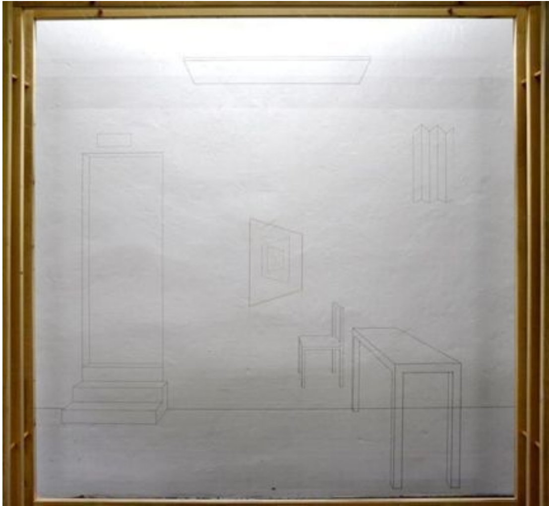
Window – Behind the curtains (close up)