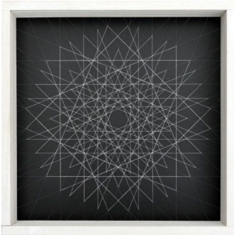
destino , 2012, white acrylic paint on fishing line , wood frame, steel, plexiglass, 50x50x7,5 cm / 20x20x3 inches