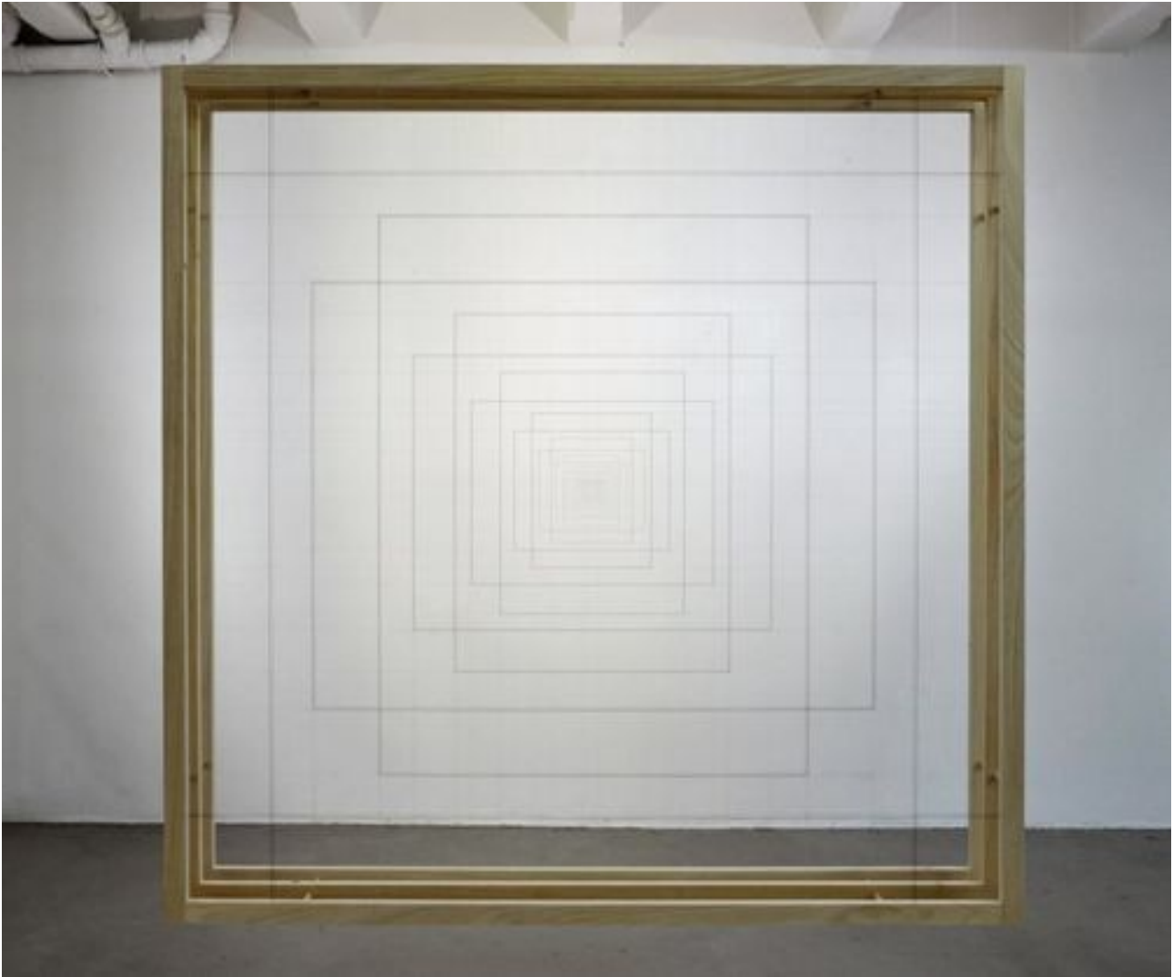
Window – mantra , 2012, black acrylic paint on fishing lines, wood frames, 200x200x25 cm / 79x79x10 inches

He constructs realistic, yet imaginary, places, playing with perception. Everyday objects become a part of an abstract, synthetic universe in which they assume a different meaning, and where space is composed, deforms and mutates continuously. The rational perception of forms in space allows him to study these elements' position in detail so as to compose parallel universes through which he can project his own interior world. Thus, in his "research", conceived as a unique imaginary room reproduced according to the four orthogonal projections, the black background behind the white luminous threads creates a sort of dark room, a threshold between perceived reality and its imaginary counterpart. The space contained in his works is a mental space, while the objects that compose it are abstractions of real artifacts. Nothing is as it appears, everything is constantly questioned, set in limbo. Observing Cavinato's works, the spectator finds himself subconsciously involved in an anamorphic game in which heterogeneous elements are composed, repeated and transformed, creating symmetrical, abstract places which are harmonious yet ambiguous, familiar yet strange, empty and ascetic. These non-places provoke a sense of expectation, of suspense.