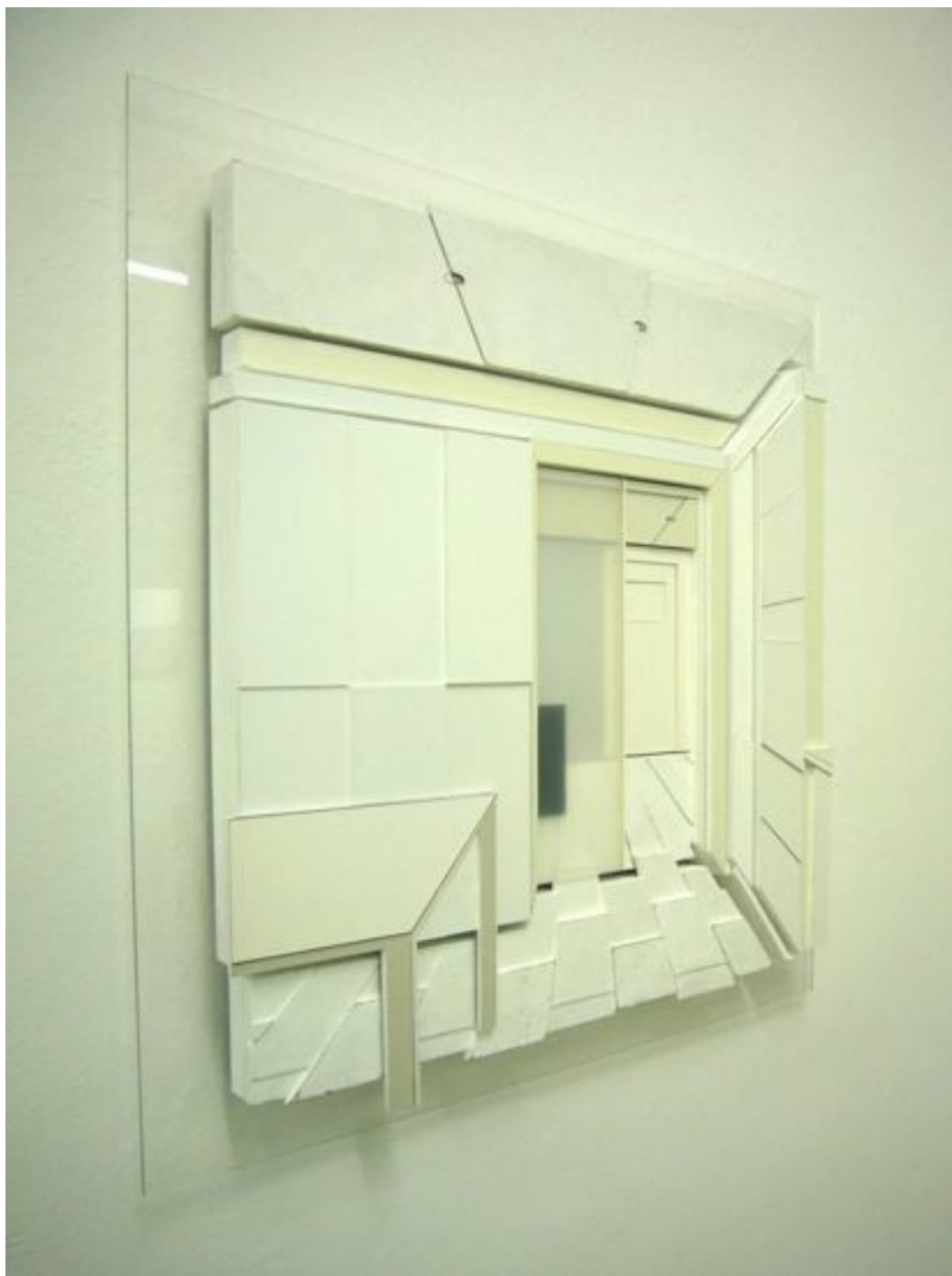
Rilievo # 2 , Sidelong View,